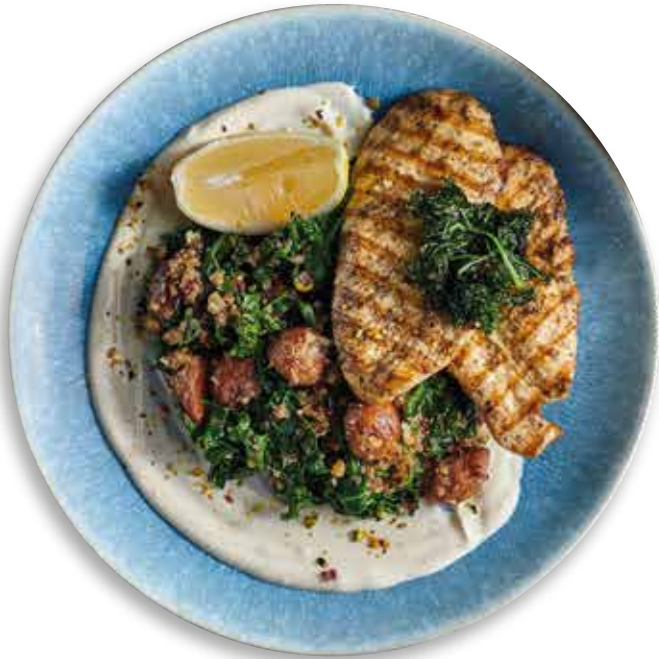
Za'atar Grilled Chicken

za'atar chicken, quinoa, baby potatoes, baby spinach, kale, yoghurt tahini dressing, crushed pistachio, chilli flakes