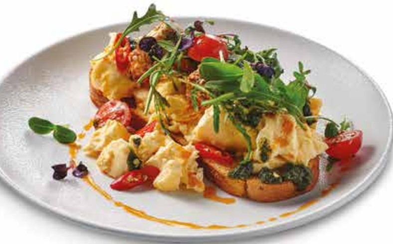
Chilli Scrambled Eggs

two scrambled eggs, feta makdous, cherry tomato, rocket, pesto, fresh chilli, multigrain/ sourdough toast