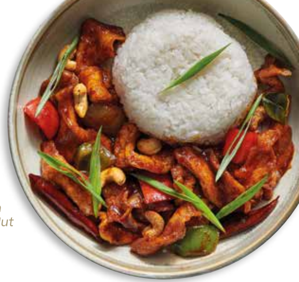
Chicken Cashew Nut

vegan mince, vegan feta, tomato sauce, salsa, lemon, lettuce, avocado, fresh chilli, coriander, cilantro rice