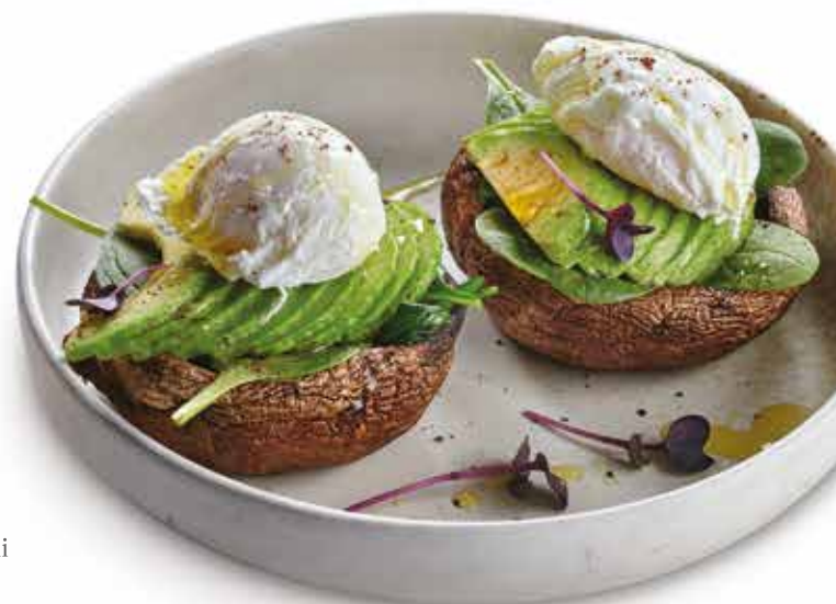
Spinach & Avo On Mushroom

two eggs your way, avocado & thalaga cheese smash, chorizo, tahini yoghurt, cherry tomato, chilli flakes, multigrain/ sourdough toast