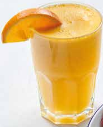
The Big Breakfast