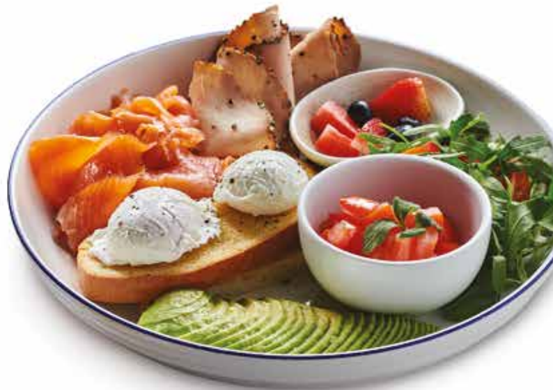
Healthy Breakfast Platter