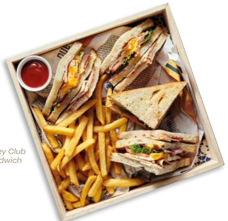
Turkey Club Sandwich