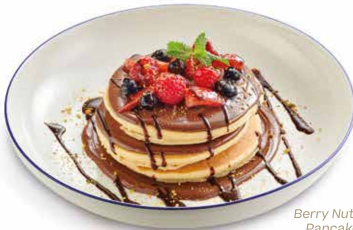
Berry Nutella Pancakes

pancakes, nutella, mixed fresh berries, crushed pistachio, chocolate sauce